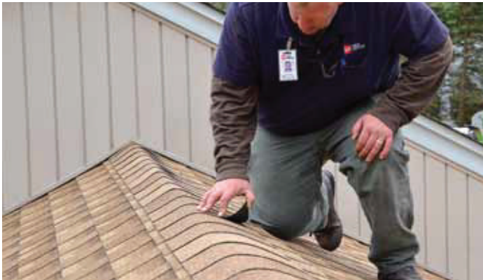
Ensuring ridge cap shingles are fastened properly and to the correct exposure, avoiding shingle blow-off.