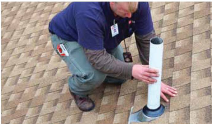
Ensuring flashings are installed properly to protect the roof deck and living space from water damage.