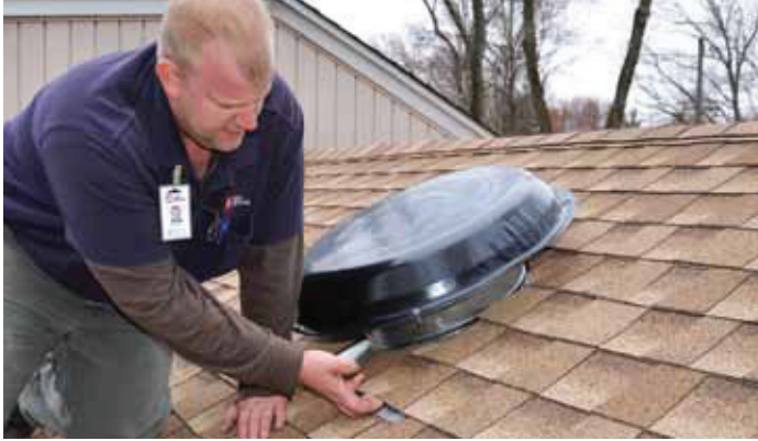
Ensuring attic ventilation and accessories are installed properly to maximize performance and prevent future leaks

PERFORMED BY GAF'S PROFESSIONAL INSPECTION TEAM